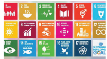
Narcotics, Crime and Justice Calendar 2030